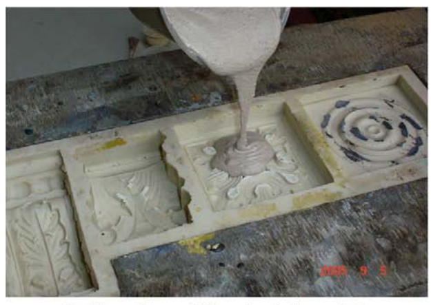
9. Pouring of final mixture into the mould.