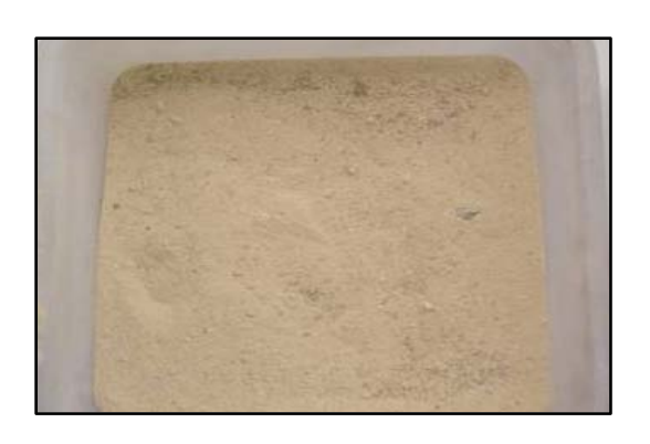
Byproduct of Carboxylic Acid