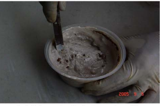
Mixing of grinded waste with inorganic composite binder.