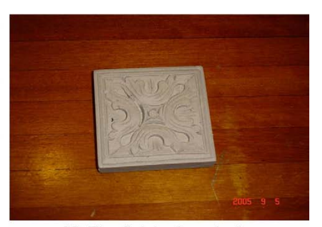
10. The finished product.