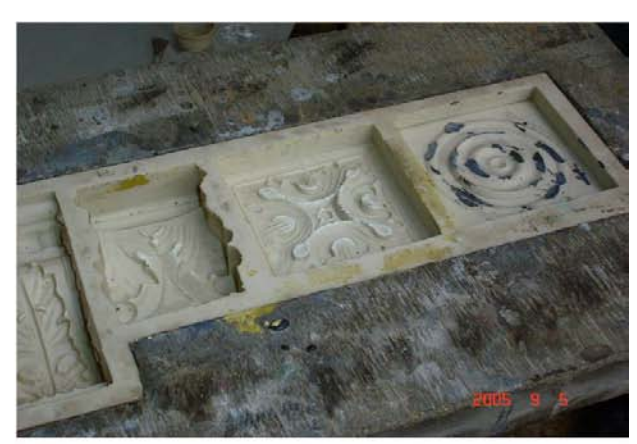
8. The mould of the architrave products.