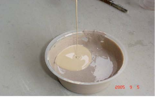
Additives and hardener are added to the mixture.