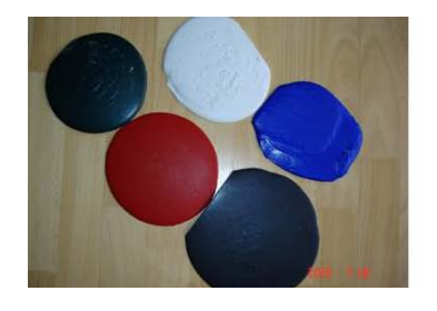
First Microencapsulation (Color Block)