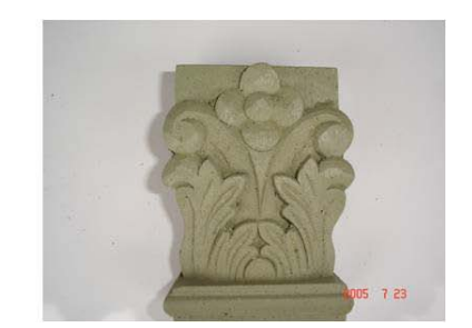
Waste Raw Material Product