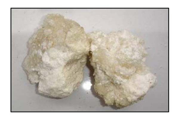
Hardened Urea Formaldehyde