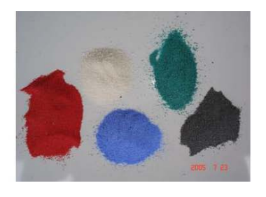
Raw Material (Color Chips)