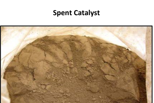
Iron Oxide Contaminated Waste