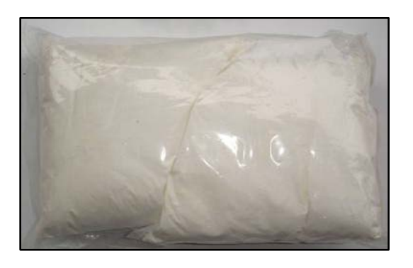
Rejected Fume Silica