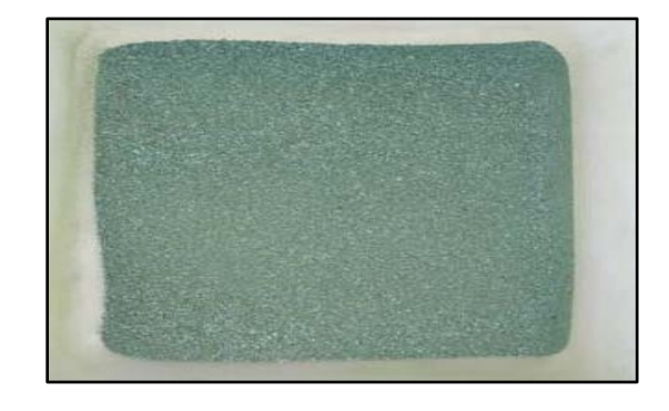
Copper Oxide Contaminated Waste