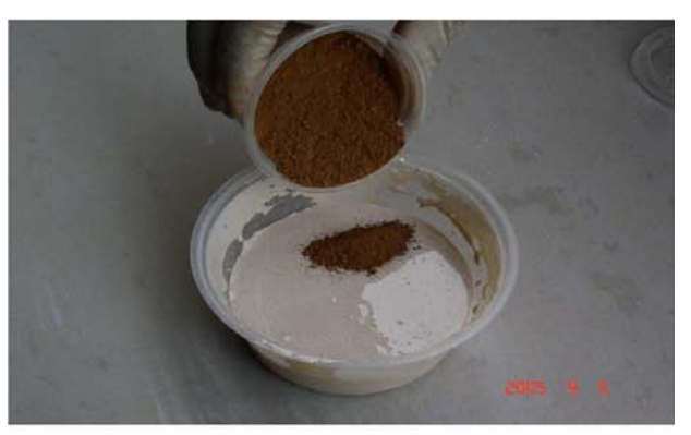
Grinded waste is mixed with inorganic composite binder.