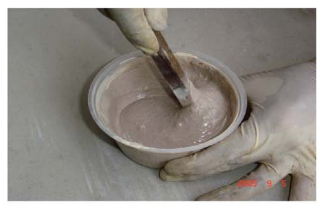
The grinded waste and inorganic composite binder must be mixed thoroughly.