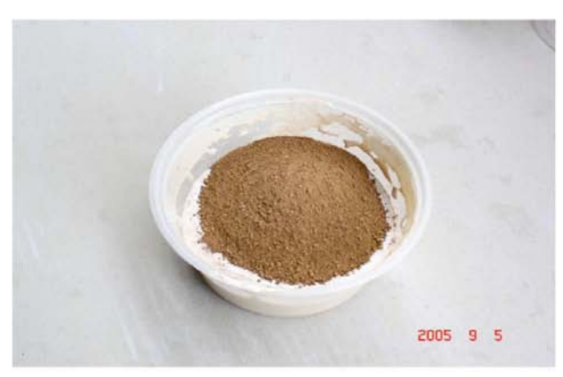
3. Grinded waste with inorganic composite binder before mixing.