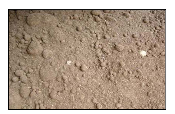
Iron Dust Waste