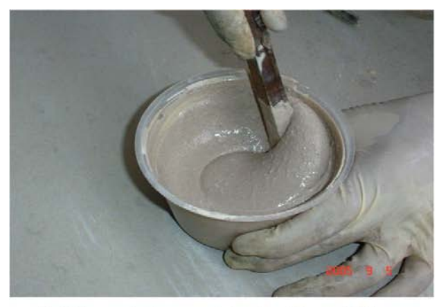
7. The mixture added with additives and hardener are mixed thoroughly.