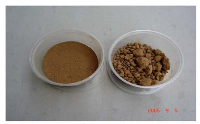
Lumpy and dry waste is grinded to powder and use as filler.